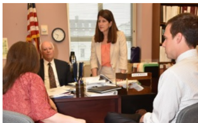
BROWN BAG LUNCH: FAIR LABOR STANDARDS