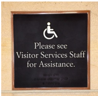
COMPLIANCE@WORK: ACCOMMODATING CONSTITUENTS WITH DISABILITIES