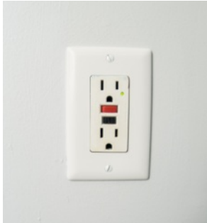
ADDRESS COMMON OFFICE HAZARDS