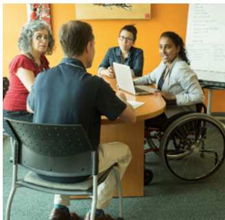
TIPS FOR A MORE ACCESSIBLE OFFICE