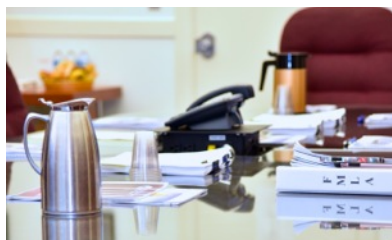
BROWN BAG LUNCH: HOSTILE WORK ENVIRONMENT