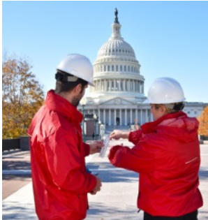
5 THINGS TO KNOW ABOUT INSPECTIONS UNDERWAY