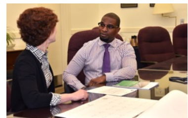
BROWN BAG LUNCH: DISPARATE TREATMENT